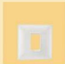
Plate & Frame (White)