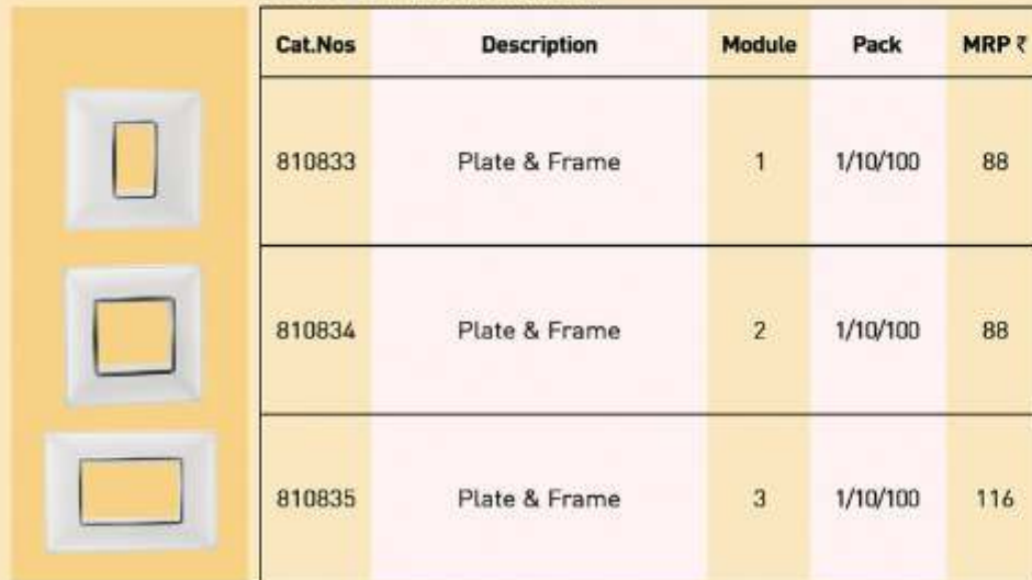
Plate & Frame (Chrome)