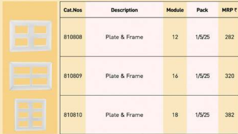
Plate & Frame (Chrome)